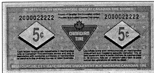
CTC S26-B Reverse