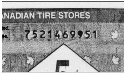
The serial number on the right hand side of this CTC S18-B note has a filled in "9". I found five consecutive with this same flaw.

Good luck collecting and don't forget to let the membership know through our newsletter about the novel ways you have found to check coupons and your special finds.