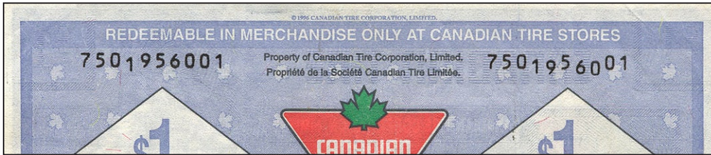
Serial number doing the "WAVE" found by Jerome Fourre #120