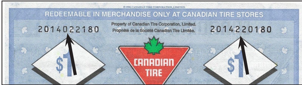
Replacement Serial number, 2 digit mismatch sent in by Lou Fontaine #109