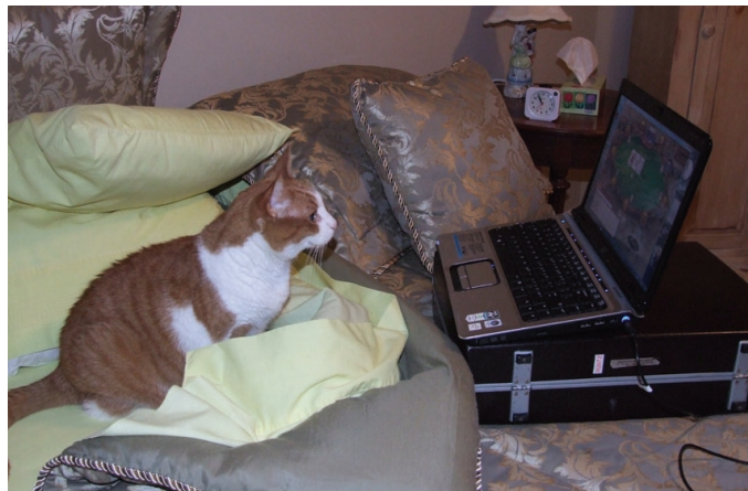
Helping me find the varieties!

The Twins - There are two white spots on the back of the S20-C – one about 1/3 up on the left dark border and the other just above the second-from-the-bottom back-ground maple leaf (about .5 cm to right of first white dot). Grids A9 and B9 (wasn't that easier!).