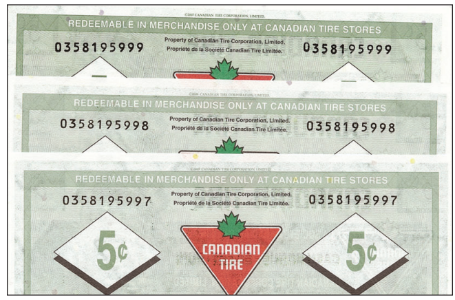
The top note is a same number replacement note from the S29 series found in the S30 series by Thayer Bouck #284