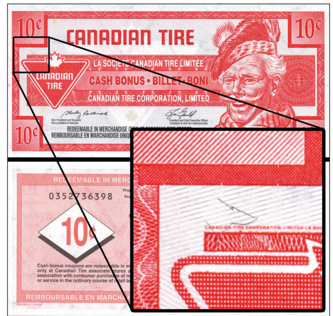
This CTC S28-C08 note has a Plate Scratch.