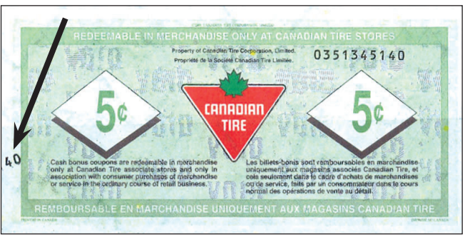
This CTC S30-B09 note is missing the left serial number. It has fallen off to the bottom of the note.