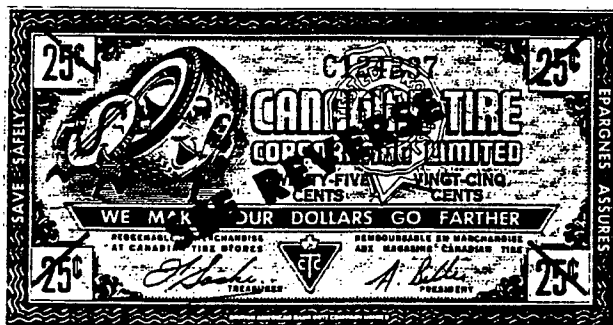
CTC 1C series Black overprint