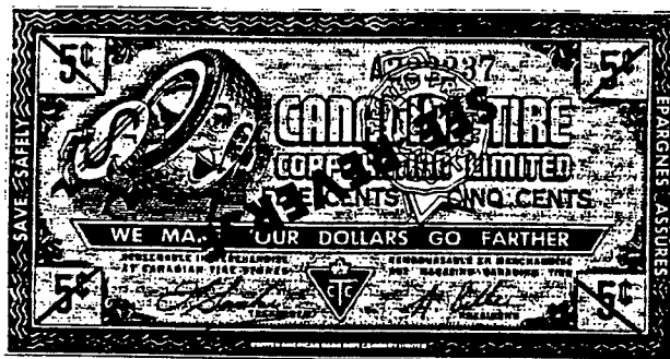
CTC 1A series Black overprint upside down