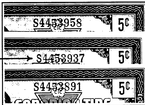
Figure 2: Coupons S 4453891, S 4453937 and S 4453958 overlapped.

I have found this special "4" digit on the following coupons: