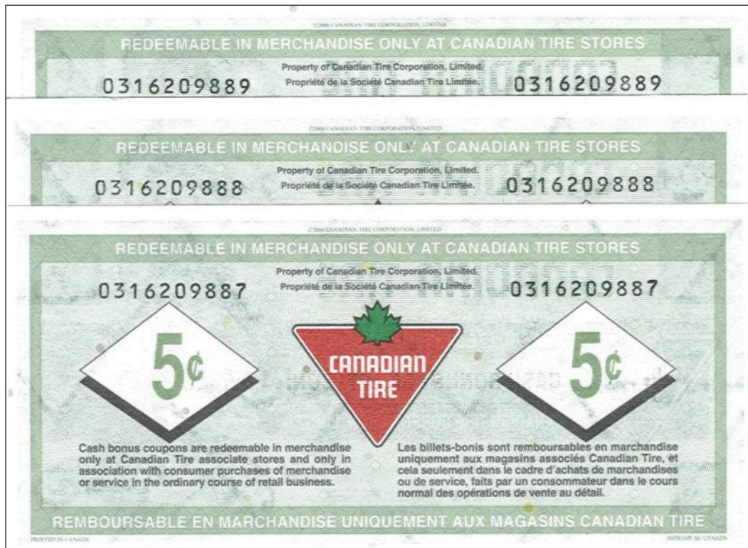
Figure 2 Notice the difference in the margins of the center note.